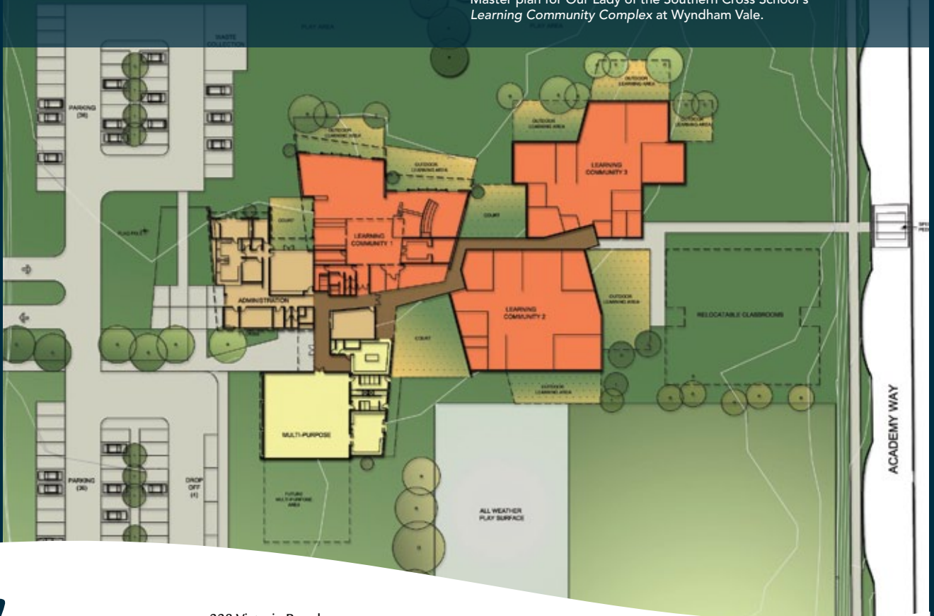
Master plan for Our Lady of the Southern Cross School's Learning Community Complex at Wyndham Vale.